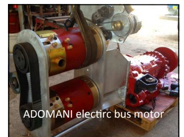
ADOMANI electric bus motor

The California Highway Patrol has approved ADOMANI's all-electric 50 passenger type-D school bus for the new school year. The Gilroy, CA School District placed the very first all electric school bus into daily operation in Sept. 2014.