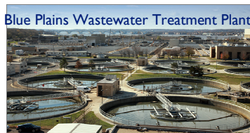
Blue Plains Wastewater Treatment Plant

As a full-service firm operating in over 100 countries, AECOM is a progressive consultancy with more than 95,000 staff worldwide and 140 offices. Their collaborative approach unites creativity with technical expertise to address complex challenges at all scales. The best practice solutions achieve notable commercial and investment.