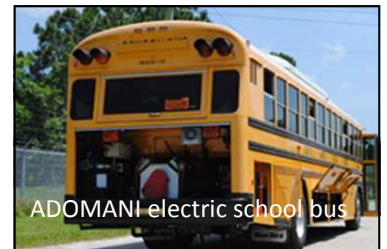
ADOMANI electric school bus

ADOMANI holds two patents and has applied for six new patents for its technology.