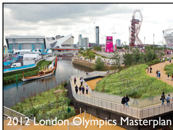
2012 London Olympics Masterplan

AECOM is an international planning, design and engineering company with extensive experience in creating leisure & cultural destinations and wastewater management. AECOM believes in the power of urban life and community. They recognize the extraordinary contribution that entertainment venues and resource recovery make to cities and the economic, social, and cultural value.